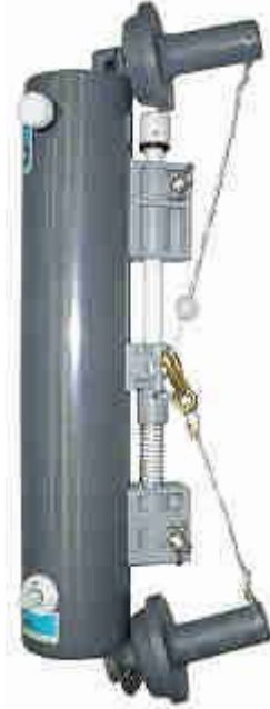
An exploded view of a Niskin bottle showing the components